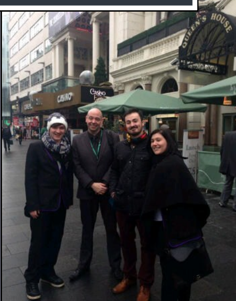
Return to list of features